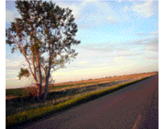
Road to Standing Rock Indian Reservation

safe and adequate transportation and public access to, within, and through Indian reservations for Native Americans, visitors, recreational users, resource users, and others, while contributing to the health and safety and economic development of Native American communities. Since the establishment of the IRR Program, the federal construction in the IRR system has exceeded $4.5 billion.