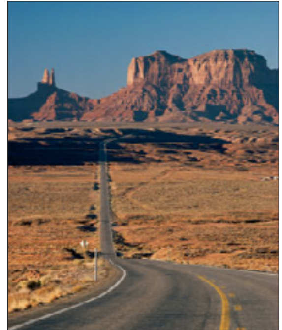
Desert road HWY 163, Monument Valley Navajo Tribal Park

The Road Safety Audit is an ambitious and comprehensive program aimed at reducing traffic fatalities. Motivation for the Road Safety Audit project on Indian reservation roads stemmed from the concern that motor vehicle crashes are the leading cause of death for American Indians aged 5 to 44. Road Safety Audits are a proactive tool, generally performed on existing or future roads or intersections by independent audit teams. Team members have various backgrounds in traffic safety, engineering, planning, design, construction, and law enforcement. Audits can be done during any phase of the construction process, and the team's findings are often incorporated into the design to improve safety.