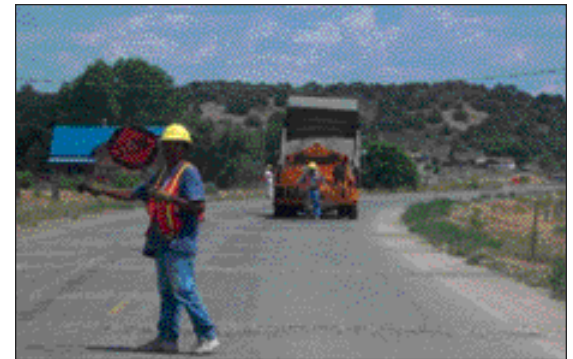
Crack Sealing Project - Jicarilla Nation