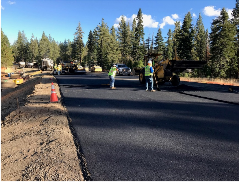
Forming Concrete Median on the Truckee River Bridge