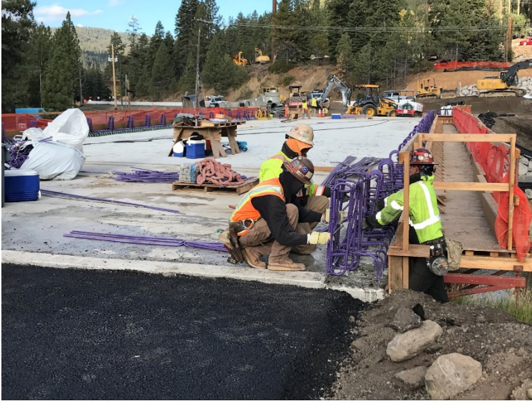
Abutment 2 View of the Truckee River Bridge – Tying Bridge Rail Reinforcing Steel