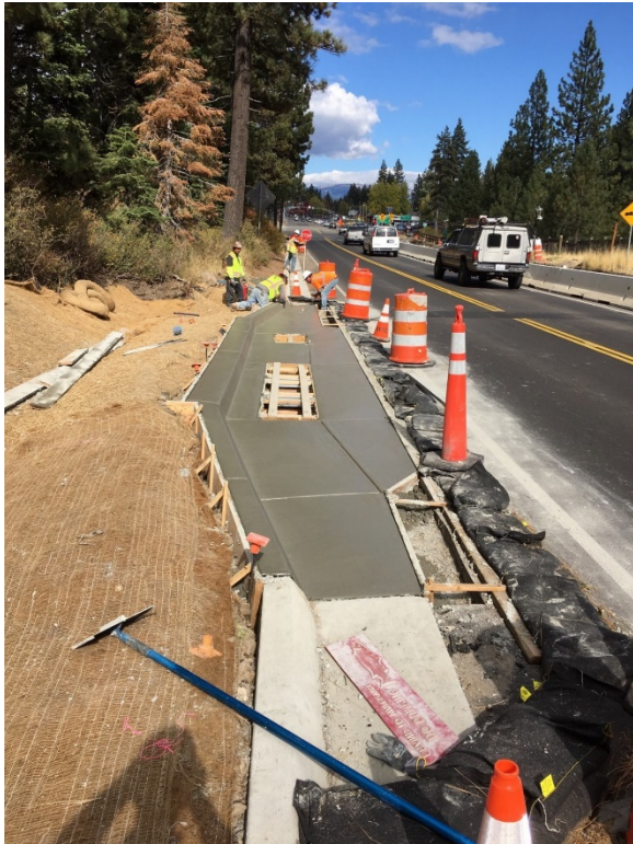
Placing Curb and Gutter at C Line