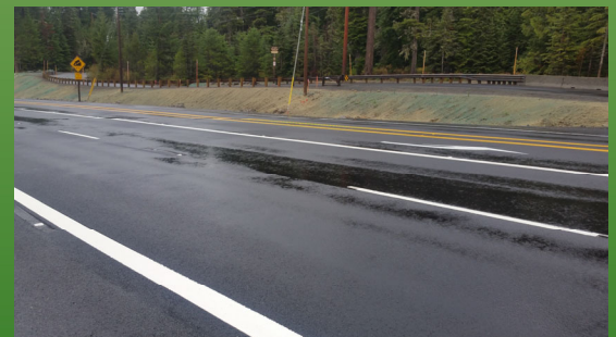
US 26 & Glacier permanent Striping

Project Website: https://flh.fhwa.dot.gov/projects/or/mirror-lake/