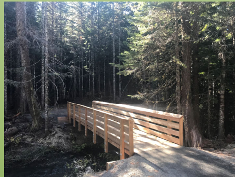
Camp Creek Bridge

With the Project reaching Substantial Completion, remaining work this week included minor punch list and cleanup, Contractor demobilization and preparations for the Mirror Lake Grand Opening.